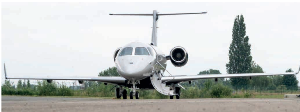
EMBRAER LEGACY 500 | OO-CYN