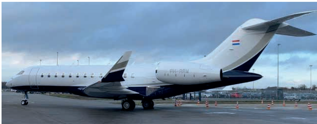
BOMBARDIER GLOBAL 6500 | PH-RRW