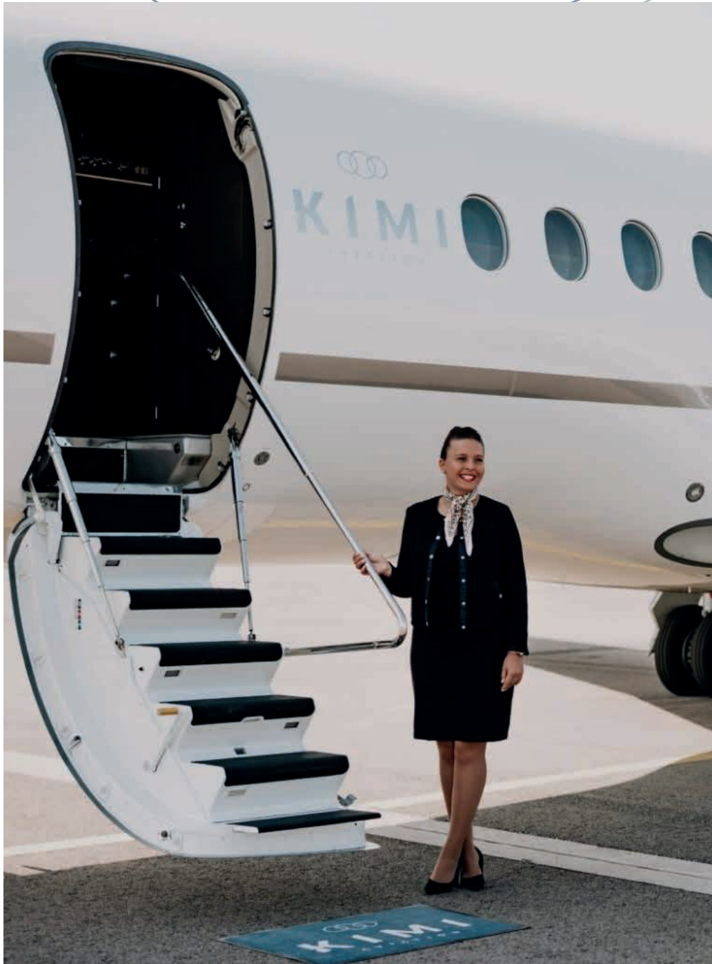
© WWW.ASLGROUPEU | DASSAULT FALCON 900 EX | PH-LAU