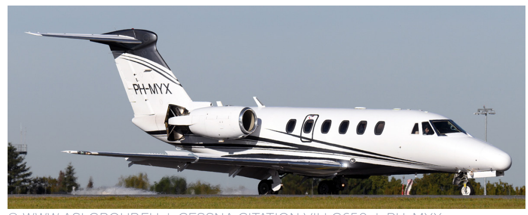
CESSNA CITATION VII | C650 | PH-MYX