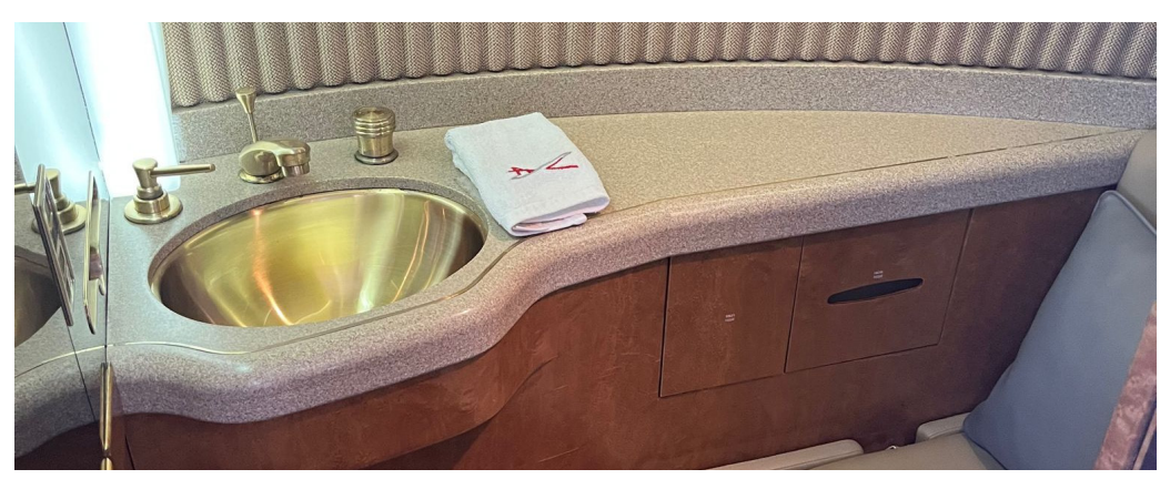
CESSNA CITATION VII | C650 | PH-MYX