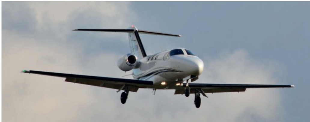
© WWW.ASLGROUPEU | CESSNA CITATION MUSTANG | C510