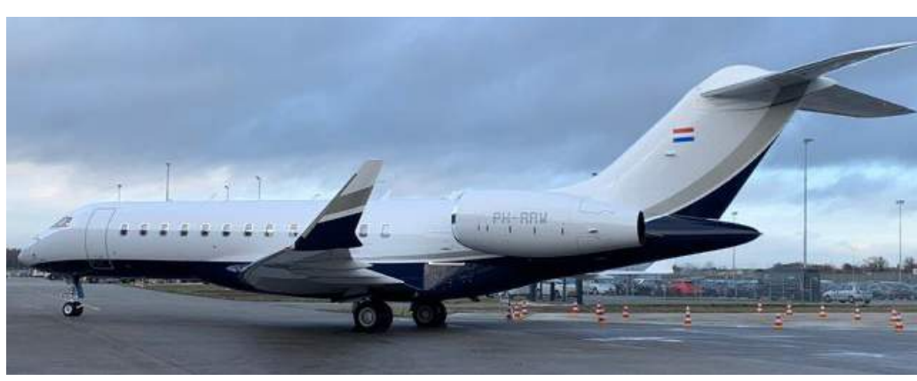
BOMBARDIER GLOBAL 6500 | PH-RRW