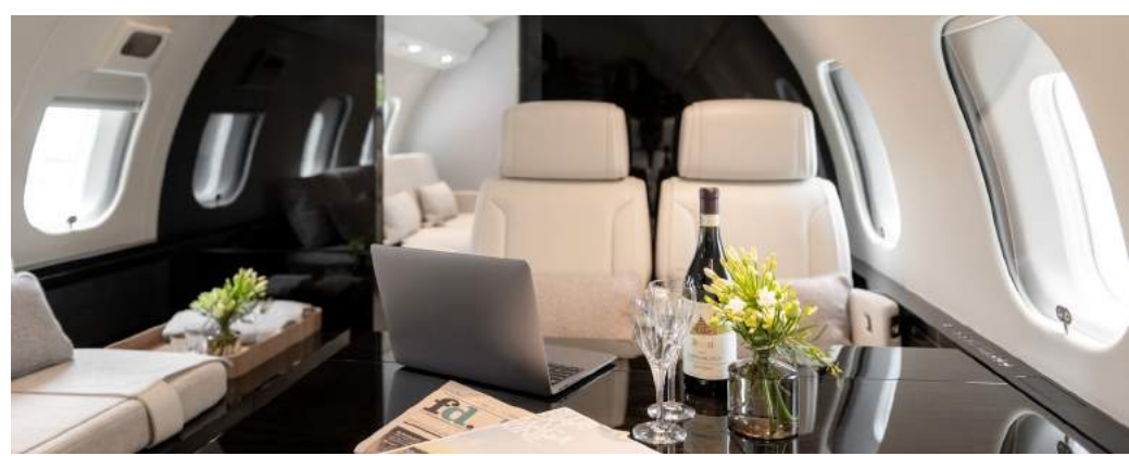
© WWW.ASLGROUP.EU | BOMBARDIER GLOBAL 6500 | PH-RRW