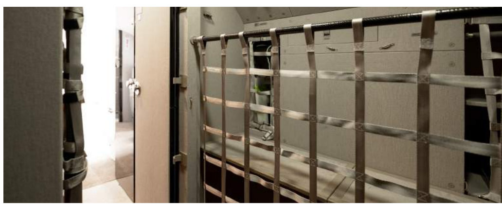
BOMBARDIER GLOBAL 6500 | PH-RRW