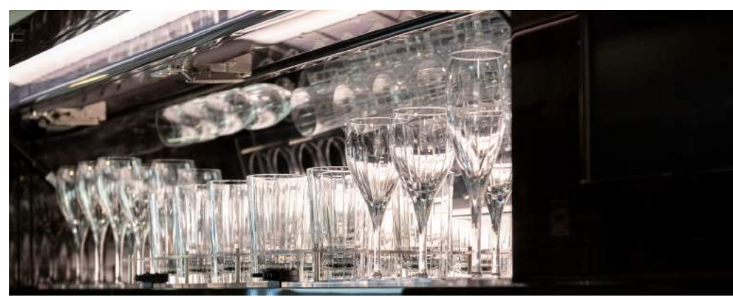
🖲 WWW.ASLGROUP.EU | BOMBARDIER GLOBAL 6500 | PH-RRW